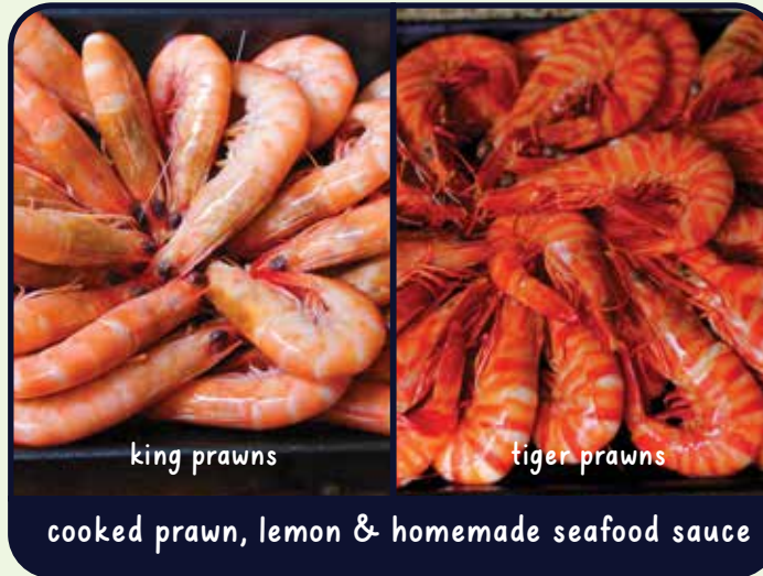
king prawns tiger prawns cooked prawn, lemon & homemade seafood sauce

A perfect selection of the ocean's finest, crafted for sharing and indulging.