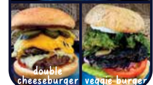
double cheeseburger veggie burger