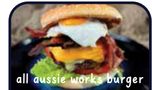
all aussie works burger