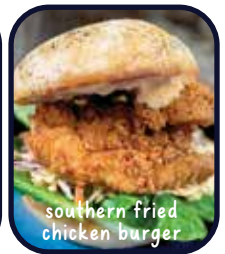
southern fried chicken burger