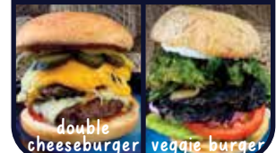
double cheeseburger veggie burger