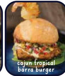
cajun tropical barra burger