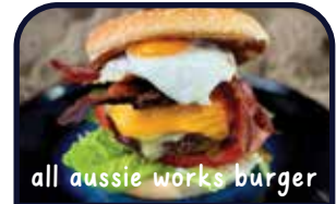
all aussie works burger