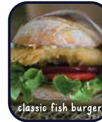
classic fish burger