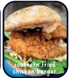
southern fried chicken burger