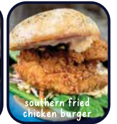
southern fried chicken burger