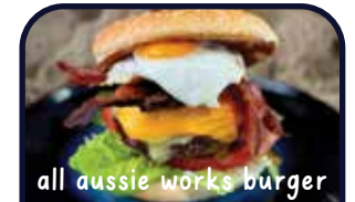
all aussie works burger