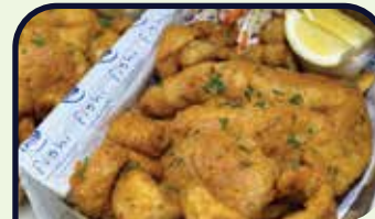
FISHERMAN'S FEAST $79.50

6 battered prawn, 8 crumbed squid, 4 piece battered fish, 4 crumbed scallop, 4 battered Homemade potato cake, homemade coleslaw, chips, lemon & homemade tartare sauce