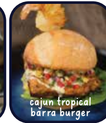
cajun tropical barra burger