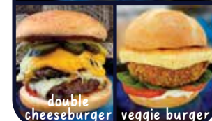
double cheeseburger veggie burger