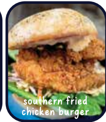
southern fried chicken burger