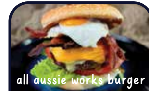
all aussie works burger