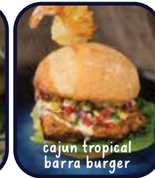
cajun tropical barra burger