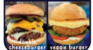
double cheeseburger veggie burger