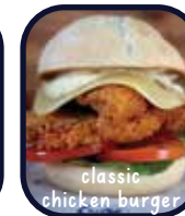
classic chicken burger