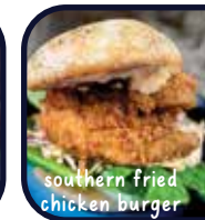
southern fried chicken burger