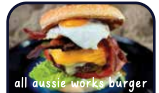
all aussie works burger