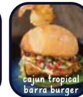
cajun tropical barra burger