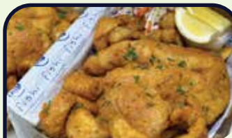
FISHERMAN'S FEAST $79.50

6 battered prawn, 8 crumbed squid, 4 piece battered fish, 4 crumbed scallop, 4 battered Homemade potato cake, homemade coleslaw, chips, lemon & homemade tartare sauce