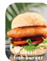
classic fish burger