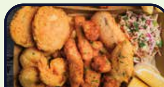
FISHERMAN'S FEAST $79.50

6 battered prawn, 8 crumbed squid, 4 piece battered fish, 4 crumbed scallop, 4 battered Homemade potato cake, homemade coleslaw, chips, lemon & homemade tartare sauce