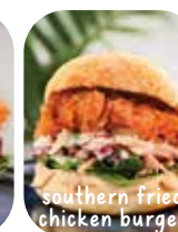
southern fried chicken burger