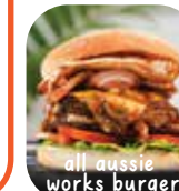
all aussie works burger