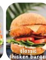
classic chicken burger