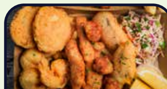
FISHERMAN'S FEAST $79.50

6 battered prawn, 8 crumbed squid, 4 piece battered fish, 4 crumbed scallop, 4 battered Homemade potato cake, homemade coleslaw, chips, lemon & homemade tartare sauce