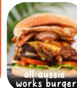
all aussie works burger