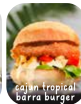
cajun tropical barra burger