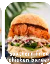
southern fried chicken burger