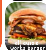
all aussie works burger