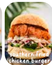
southern fried chicken burger

CHEESEBURGER $15.50 1 beef patty, pickles, cheese, mustard & ketchup