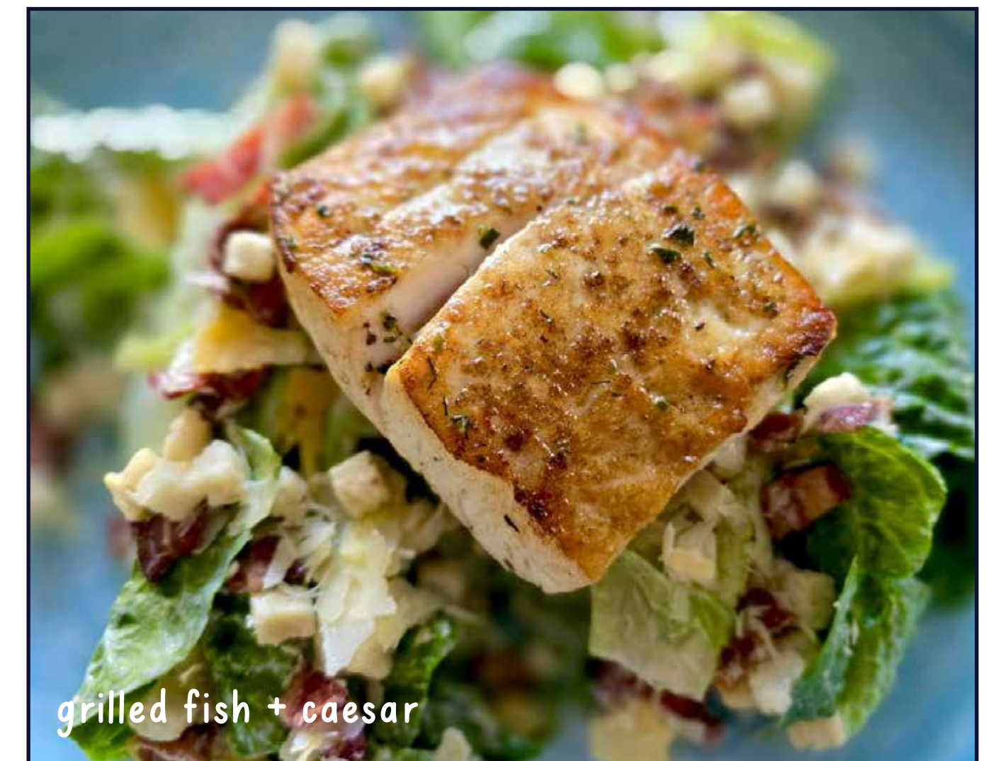
grilled fish + caesar

SEASONAL FRESH DAILY SALADS AVAILABLE Ask our staff for today's fresh salad options