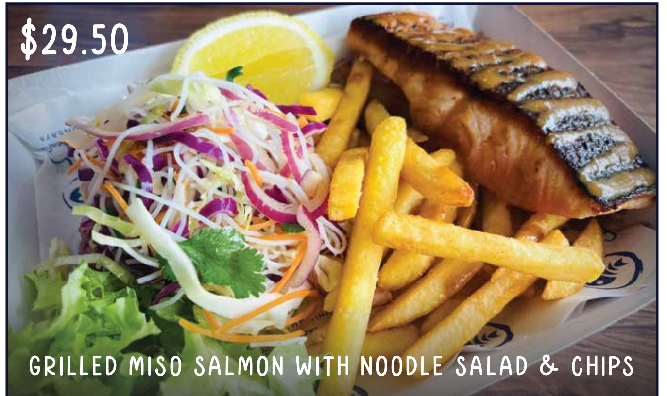
GRILLED MISO SALMON WITH NOODLE SALAD & CHIPS