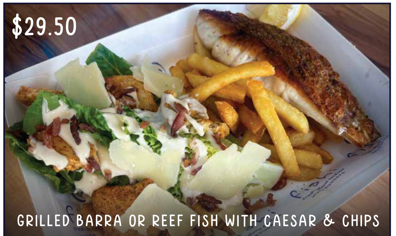
GRILLED BARRA OR REEF FISH WITH CAESAR & CHIPS

FRESH SALADS AVAILABLE DAILY See our deli case to choose